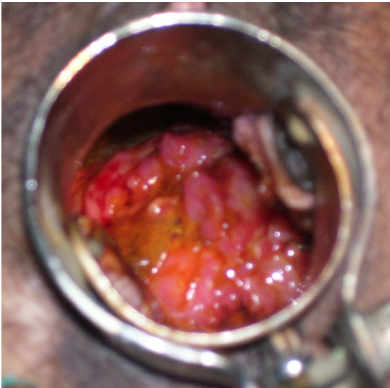
Figure 1 Per speculum view of the cervix at the time of presentation.

almost normal appearance and there was complete relief from symptoms.