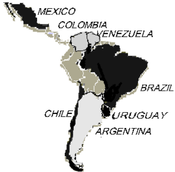
FIGURE 1. LATIN AMERICAN COUNTRIES INCLUDED IN THE PLATINO PROJECT (BLACK); AND POTENTIAL SITES (LIGHT GRAY).