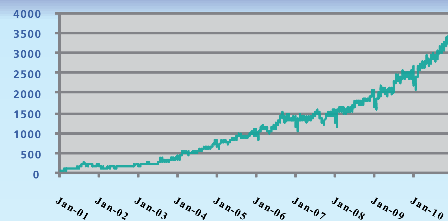
Total monthly submissions to OA journals published by BioMed Central and Chemistry Central