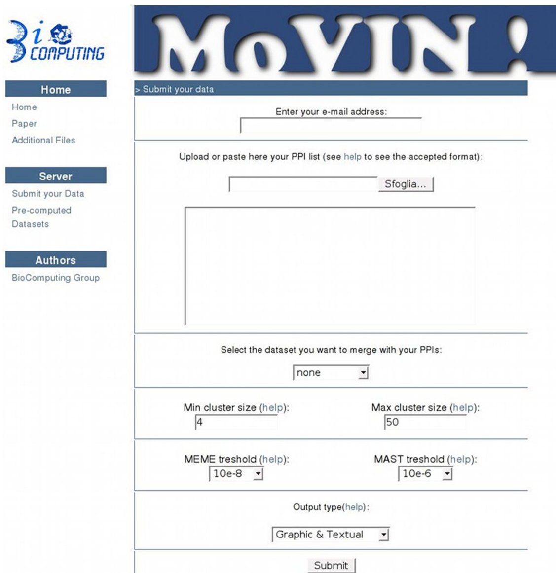
Figure 1 Snapshot of the input page of the MoVIN server. The user can upload a Protein-protein interaction map in any of the accepted formats (tab or comma separated) with or without merging it with existing datasets. The minimum and maximum cluster size as well as the threshold E-values for MEME and MAST can be selected as well.

distribution function, which measures the probability of finding at least as many occurrences of the motif in a cluster of similar size randomly extracted from the whole set of proteins.