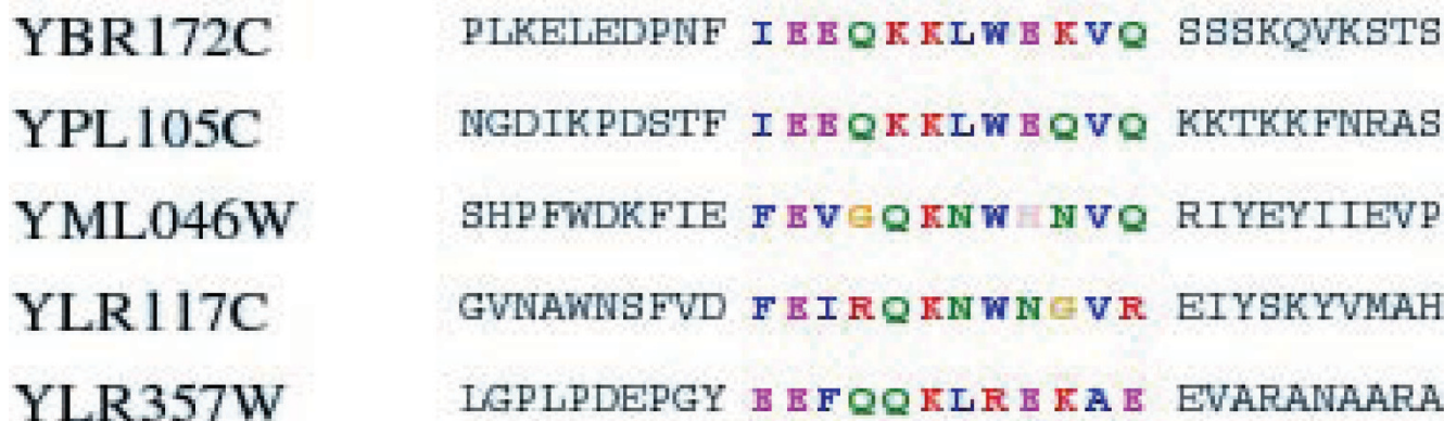
Figure 3 Alignment of the motif present in 5 out of the 7 proteins binding to YKL074C. The first protein (YBR172C) is annotated as "Cytoskeleton organization and biogenesis", the second (YPL105C) does not have any GO annotation. The last three (YML046W, YLR117C and YLR357W) are annotated with terms related to the spliceosome activity.

The high-confidence PPI dataset (MOVIN_1) was generated by merging all the interactions that, at least in one