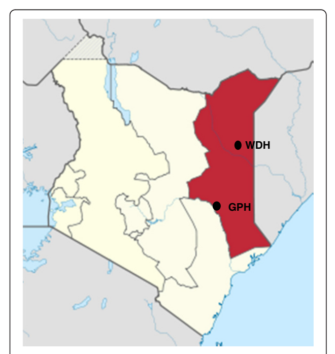
Fig. 1 Map of Kenya showing Northeastern Province of Kenya (shaded area). The location of Garissa Provincial Hospital (GPH) and Wajir District Hospital (WDH) are marked with black dots

Drinking of raw milk is common in this population due to deep-rooted cultural traditions. It is believed that boiling milk reduces the nutritional value of milk. Milk is also mixed from several animals in common containers. From this milk, fermented products (local name 'susac') are prepared. Susac would then be sold at the nearest open market places and nomadic camp sites [15, 31]. This province was selected because public health support and disease surveillance has been extremely limited and outbreaks of re-emerging diseases have been reported in the province before [32–34].