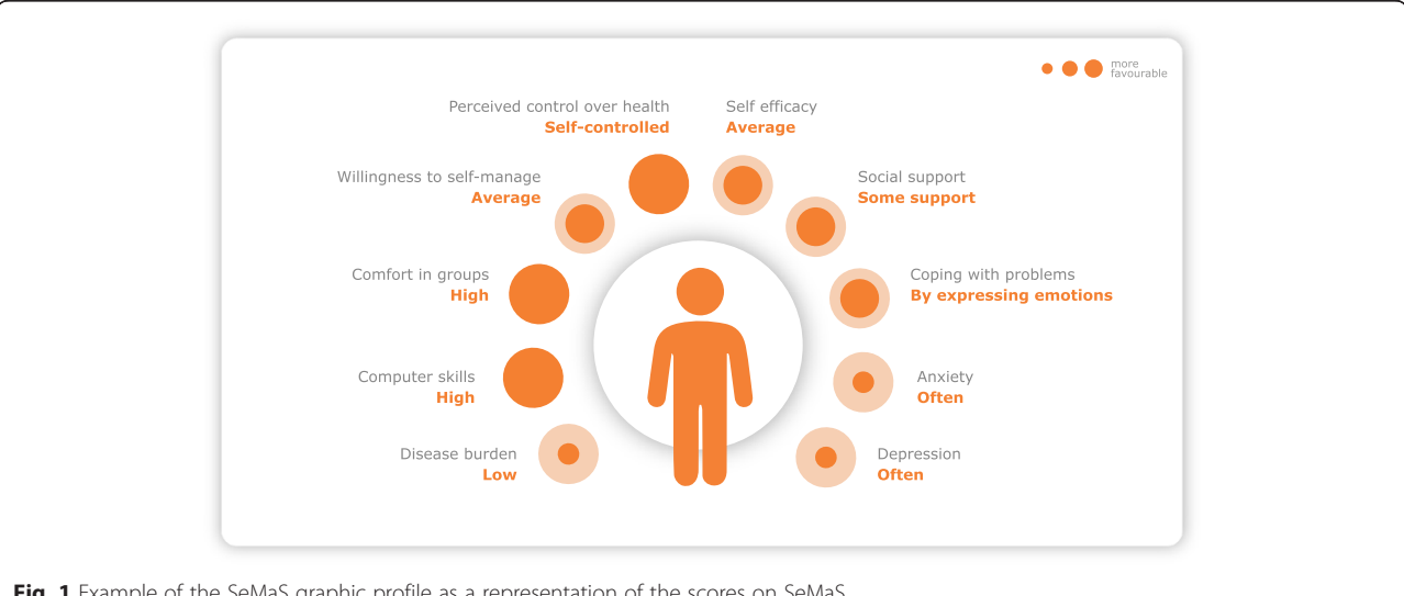
Fig. 1 Example of the SeMaS graphic profile as a representation of the scores on SeMaS

The construct and criterion validity of the SeMaS tool were tested in an observational study with a sample of patients from two general practices.