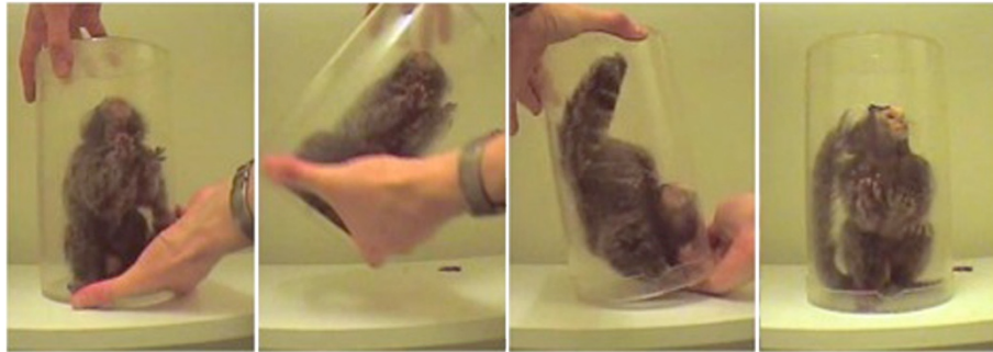
Figure 2 Image of Hourglass. A cylinder measuring 11 cm x 27 cm was used to turn the animal upside down in the Hourglass setup. One trial period consisted of turning the cylinder 180°, causing the marmoset to be in a head-down position, to the moment the marmoset is once again in an upright position. Intervals between cylinder turn and the marmoset's ability to recover its position (head above legs) was noted (righting time) with non-automated video analysis, done by an observer. Maximum time noted was 30 s (also for marmosets which did not turn upright at all). One test comprised 10 180° turns of the cylinder.