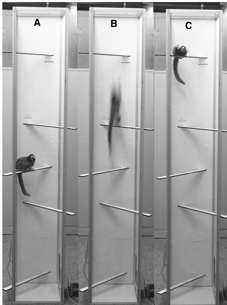
Figure 3 Image of Tower. The Tower test setup consisted of a 230-cm high cabinet with a transparent Plexiglas front, in which five horizontally situated crossbars with varying distances between 10, 19, 45, 70 and 50 cm, respectively. At the start of a test, a marmoset was located behind a sliding door adjacent to the bottom of the cabinet. After opening of the sliding door, the marmoset enters the cabinet. Simultaneously, an observer sitting in another room in front of a video screen recorded each point of time the marmoset jumped from one level to another over a 10-min period. The figure shows a marmoset at level 3 (A) and jumping (B) to level 5 (C).