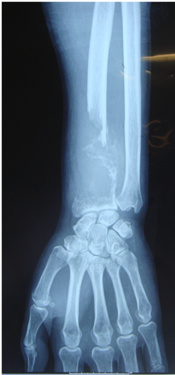
Figure 1 X-ray radiograph showed a large osteolytic lesion of the distal region of the left radius.