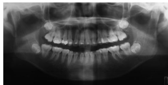
Figure 7 Post treatment panoramic radiographs. Post treatment panoramic radiograph showed reasonably root parallelism.