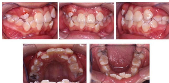
Figure 1 Pre treatment intraoral view.

Due to the severity of crowding, the first option of treatment plan was to extract all the first premolars (14, 24, 34, 44) to provide space for alignment and correction of the dental midlines. Due to high anchorage demand and a large amount of root movement involved, an alternate treatment option was to extract both upper canines (13, 23) and lower first premolars (34, 44). The advantage of the latter option is the reduction in overall treatment time. The disadvantages are compromised aesthetic, difficulties