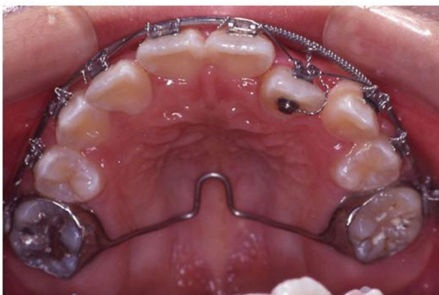
Figure 5 Piggy back technique to align the in-standing. The in-standing upper left lateral incisor (22) was brought to the arch with piggy back technique.

The 48 months of treatment time may seem longer than average, but patients with ectopically positioned canines are perceived to be more time-consuming to treat than average orthodontic patients. It is of utmost importance