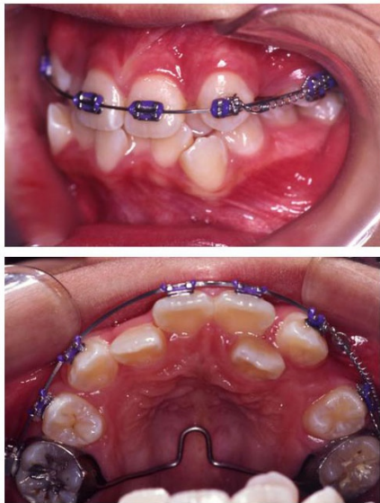
Figure 4 Nine months into treatment. Upper left canine (23) was retracted on 0.019 × 0.025-inch stainless steel wire with a nickel-titanium coil spring.

measurements did not change significantly. A functional and good-looking occlusal result was achieved. The patient was satisfied with her teeth and profile.