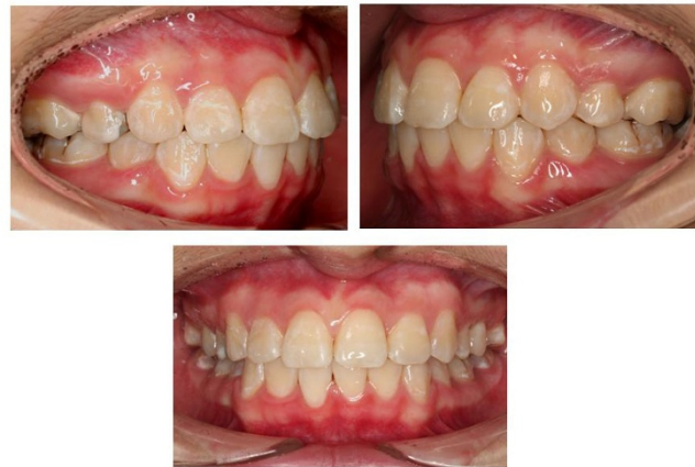
Figure 6 Post treatment intraoral views. Figure illustrates good occlusion and pleasing gingival contour.

in this case is to minimize undesirable side effects like the reactive moments on the anchor teeth, unwanted roots contacts and root resorptions. The anchorage on the transpalatal bar was possible to control the movement of the molars. With gentle, careful activation of archwire every visit, the amount of rolling of the round wire in the bracket or tubes will be negligible. Roots contact that may be caused by palatal root torque of canines can be avoided by carefully evaluating the proximity of the roots of the