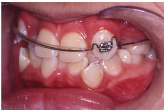
Figure 2 The modified 2 by 1 appliance: Left buccal segment-note the root of upper left canine (23) in mesial position.

Extraction of lower first premolars (34, 44) and placement of pre-adjusted appliance at the lower arch at the 18 th month treatment. To prevent dumping of the lower inci-