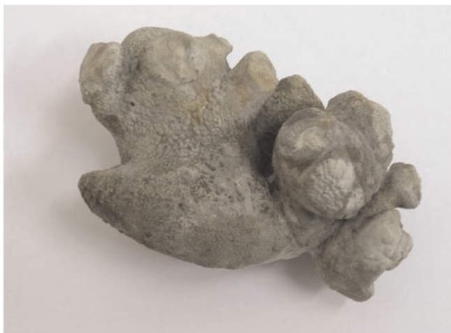
Figure 2. The stone that removed completely, its weight was 123 grams.

In IVP that was done 2 month after surgery, normal function of the kidneys, especially, operated left one, was noted (Figure 3). Urine cultures, one month, two month, 6 month and, one and two years after operation, all were