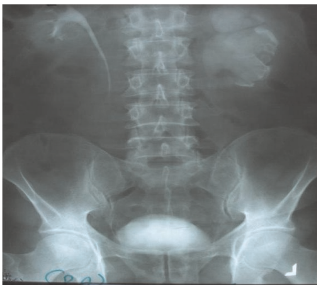
Figure 1. IVP, just before surgery, large staghorn of left kidney is evident.

kidney with nephrotomy incision, the stone removed completely (Figure 2) within 5 min after artery ligation. The ligature released after 9 min.