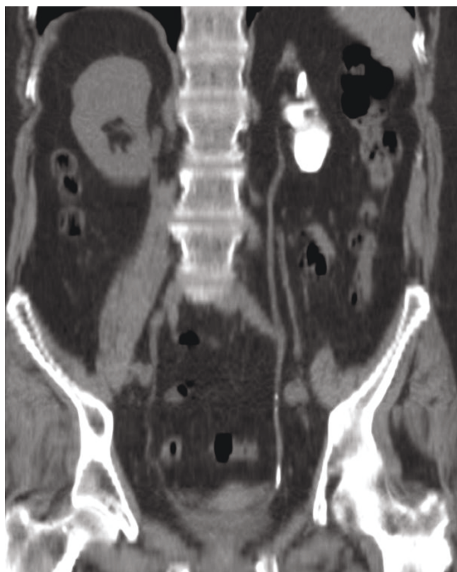
Figure 2. Non-contrast CT, coronal curves reformat.