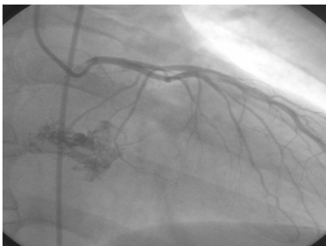
Figure 1. Left coronary angiograms demonstrating vascular supply to the myxoma.

left atrial myxomas are frequent, however the involvement of coronary artery is extremely rare and atrial myxoma is an unusual cause of myocardial infarction [2].