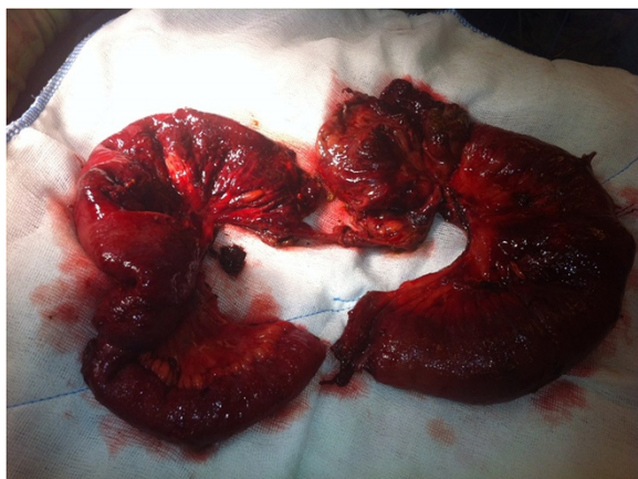
Figure 3 Specimen image: resected specimen of the small bowel due to perforation related to ureter torsion.

Peritoneal adhesions may develop after pelvic and abdominal surgery or their combination [11]. Additionally, ingeminate pelvic or abdominal surgery increases the possibility of intra-abdominal adhesions. Retrospective studies have reported that 32 to 75 percent of patients who undergo abdominal reoperations encounter adhesion-related intestinal obstruction [12]. In contrast to congenital or postinflammatory adhesions, which are mostly asymptomatic, postoperative adhesions cause 40 percent of all cases of intestinal obstruction [13]. Intra-abdominal adhesions are predominantly diagnosed intraoperatively. Taking a careful history can substantiate the suspicion of adhesions; no other clinical investigations or imaging procedures enable a confident diagnosis [14]. In our case, we performed CT imaging due to the suspicion of a recurrent mass, but the CT images could not clarify the etiology of the bowel obstruction.