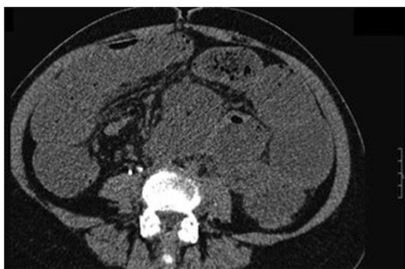
Figure 1 Computed tomography image: a group of poorly enhanced and thickened bowel walls on non-contrast computed tomography.

An aggressive fluid-electrolyte resuscitation (20ml/kg/hr) and antibiotics (ceftriaxone 2 gr/ 24h and metronidazole 500mg/6h intravenous) administration was started immediately in the intensive care unit. Because these radiological findings were suggestive for obstruction and bowel ischemia, our patient underwent emergency surgery six hours after admission.