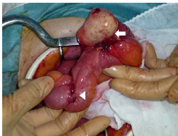
Figure 2 Intraoperative photograph showing a cystic tumor of the appendix (arrow) and a hard mass of the terminal ileum (arrow head).

intestinal lesions. All laboratory data including serum levels of carcinoembryonic antigen and carbohydrate 19–9 on admission were within normal limits. Because of the difficulty in distinguishing benign mucinous neoplasm from malignant cystadenocarcinoma based on abdominal imaging, we planned to excise the appendiceal tumor with an adequate margin and without inadvertent tumor rupture and mucous spillage during surgery. At laparotomy, a 2-cm ileal mass with serosal indentation was incidentally found at approximately 7cm from the ileocecal valve (Figure 2). There was a small myoma in the uterus, which had been identified before surgery. Otherwise, the small intestine, the mesentery, the mesenteric lymph nodes and bilateral ovaries appeared normal. Ileocecal resection including appendiceal and ileal tumors in the surgical specimen was followed by a functional end-to-end ileocecal anastomosis using linear staplers. Histopathological examination of the resected specimen revealed a mucinous neoplasm with low-grade dysplasia of the appendix (Figure 3A) and endometrioma