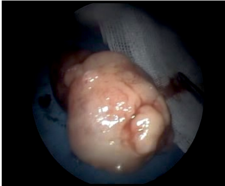
Figure 2 Photograph of the nasopharyngeal mass. The nasopharyngeal mass was approximately 4 cm × 3 cm in size and was totally resected under local anesthesia via an endoscopic approach.

lateral supraorbital ridge and nose. In the nose, they occur most commonly in the bridge and always in the midline. A few cases of dermoid cysts arising from the paranasal sinuses have been reported. The term hamartoma refers to an abnormal, oncologically benign proliferation of indigenous tissues. The sinonasal tract, particularly the area of the nasal septum, is the most common site for hamartomas of the head and neck region. At the histological level, benign disorganized epithelium, salivary glands, muscle, and cartilaginous and vascular tissues are seen [4-7].