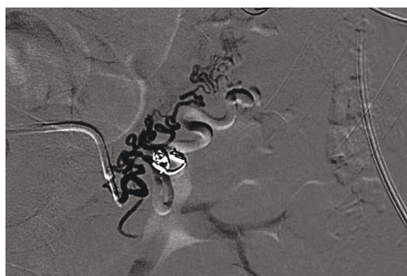
Figure 4 Digital subtraction arteriography performed after selective embolization of the lesion with the use of microcoils. Complete excision of the lesion is shown. The renal pelvis is opacified by contrast medium used for arteriography.

fistulas are a post-operative complication after nephrostomy or nephrectomy, particularly in cases of intra-operative injuries of the renal pedicle [14,15].