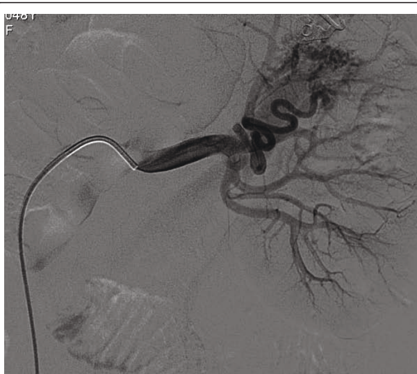
Figure 3 Selective digital subtraction arteriography of the left kidney showing dynamic images of the AVM. The black arrow indicates the renal artery, the white arrow indicates the AVM, and the arrows indicate the renal vein.

Acquired fistulas are usually caused by iatrogenic injuries. A fistula can appear after renal needle biopsy, often in kidney transplant patients, and sometimes these