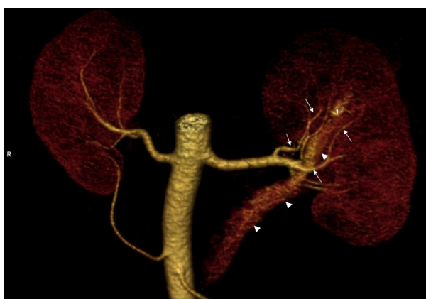
Figure 2 Computed tomography with iodinated contrast enhancement shows the presence of tortuous blood arterial vessel with thin arterial ramifications of spiral form. The arrowhead indicates the renal vein, the arrows indicate the renal artery, and the asterisk indicates the renal AVM.

AVFs are a congenital condition in 20% to 30% of cases. It is usually located on the kidney upper pole (45%), but it also can be detected in the mid-point or in the kidney lower pole in an equal ratio [13]. The left kidney is more frequently involved, and women are affected twice as often as men. The peak incidence is in patients ages 30 to 40 years, and AVFs are rare in the pediatric population [2].