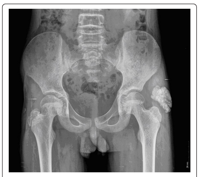
Figure 1 A 14-year-old boy with a multilobular, calcific mass around his left hip joint.