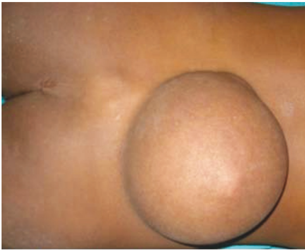
Figure 1 Photograph showing the teratoma in the lumbosacral region.

performed to establish the extent of the tumor. MRI of the lumbosacral spine revealed a well-defined lesion in the midline extending to the right gluteal region in the subcutaneous plane from approximately the L3-L4 to the S4 vertebrae and crossing the midline. It was further observed that the tumor was hyperintense on T1-weighted images and hypointense on T2-weighted images, which was