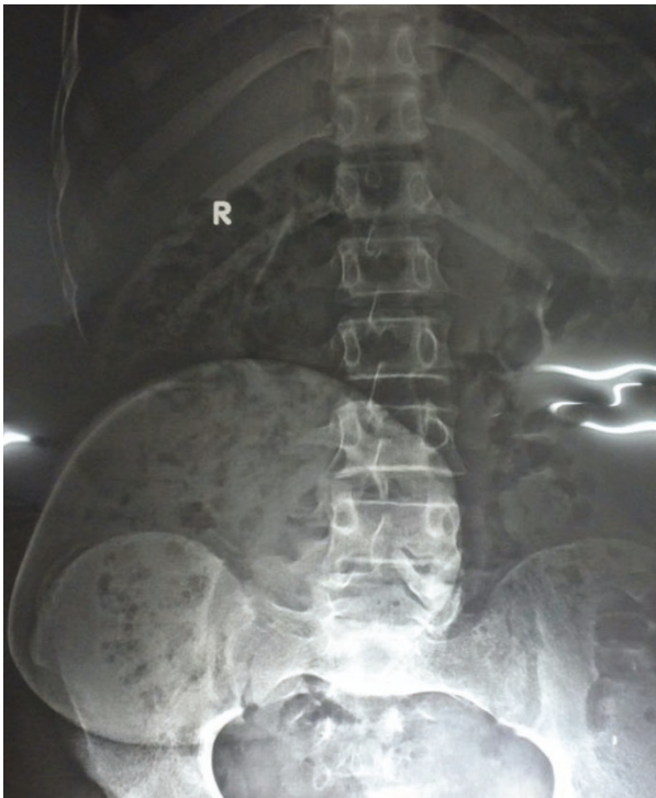
Figure 2 Radiograph showing the well-defined outline of the teratoma.

performed to establish the extent of the tumor. MRI of the lumbosacral spine revealed a well-defined lesion in the midline extending to the right gluteal region in the subcutaneous plane from approximately the L3-L4 to the S4 vertebrae and crossing the midline. It was further observed that the tumor was hyperintense on T1-weighted images and hypointense on T2-weighted images, which was