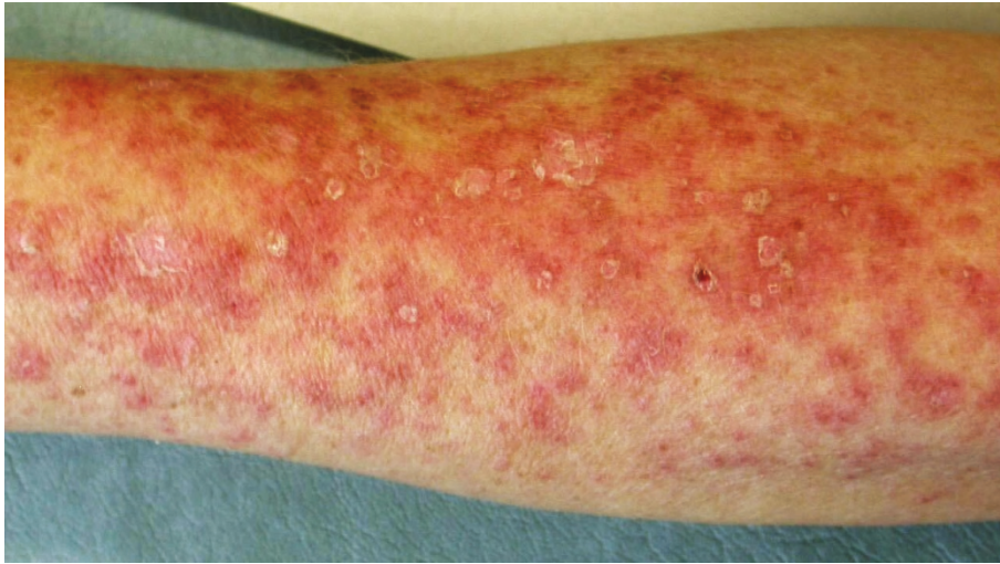
Figure 1 Patient's forearm on day 36 after beginning paclitaxel-bevacizumab combination therapy.

Cutaneous LE has not previously been described in patients treated with bevacizumab. However, previous studies involving skin specimens have shown that receptors for VEGF are present in keratinocytes in human epidermis [13]. Similarly, Kikuchi and co-workers [14]