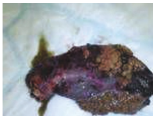
Figure 1 Gangrenous cholecystitis.

Contini et al. [4] showed that the time of hospitalization delay plays a crucial role in the formation of GC. The time between the onset of symptoms and hospital admission was significantly longer in patients with GC. The patient's history (timely or delayed admission) and