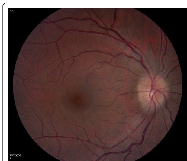
Figure 2 Resolution of papilledema after the withdrawal of ciprofloxacin.