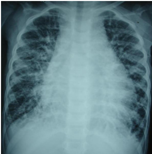
Figure 1 Chest X-ray shows enlarged heart and increased markings in both lung fields.

immunodeficiency virus (HIV) via rapid screening test. High-resolution computed tomography (HRCT) scan showed peculiar diffuse polygonal lobular architecture (Figure 2) and soft tissue mediastinal mass. A needle biopsy of the mediastinal mass revealed only fat and connective tissues. Repeated pericardial fluid analyses for malignant cells were negative. Her platelet counts were 50 to 70,000/mm 3 on multiple occasions. She also tested negative for disseminated intravascular coagulation (DIC). Her bone marrow was normal.