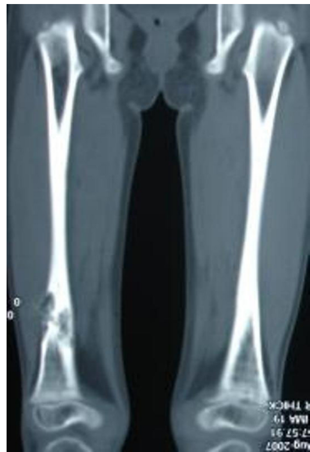
Figure 3 A coronal computed tomography shows osteolytic lesion in the lower third of right femur.

Treatment with interferon alpha was discussed but her parents did not consent to it. Thalidomide (50 mg/d), octreotide and epsilon-aminocaproic acid were tried empirically, but her response to this treatment was not sustained. Low-dose radiotherapy of 20 Gy over 10 days were also given to her pericardium. A pericardiectomy was done after exhausting all options. Lung biopsy taken at that time showed diffuse hemangiolympangiomatosis (Figure 4). There were numerous anastomotic proliferating, and cystic spaces in the pulmonary interstitium were lined by endothelial cells. The cells lining the spaces were