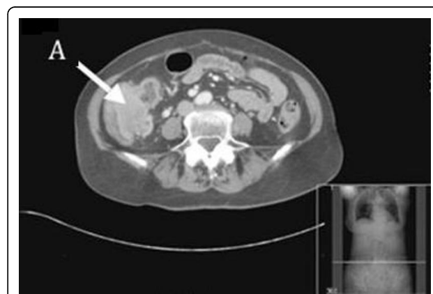
Figure 1 Computed tomography showing a recurrence of Merkel cell carcinoma in the caecum at 18 months after the initial diagnosis. There is a 6 × 4.3 cm soft-tissue mass seen in the region of the ileocecal valve (A) which extends into the lumen of the caecum. There are multiple abnormal lymph nodes measuring up to 2 cm within the ileocolic mesentery. There is nodularity and irregularity seen around the tumour extending into the pericolic fat suggestive of a local tumour infiltration.

Our patient underwent a laparoscopic right hemicolectomy. At surgery the tumour was seen to be fungating and involved the full thickness of her bowel wall. Histological examination showed clear resection margins but vascular invasion and multiple lymph node involvement were also noted. Our patient's postoperative