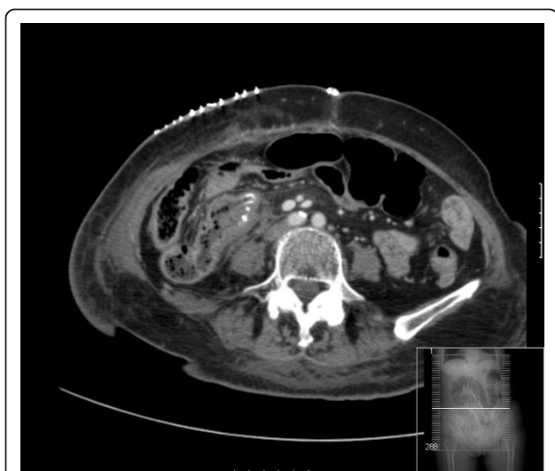
Figure 3 Postoperative computed tomography scan following laparoscopic right hemicolectomy. There is an end-to-side anastomosis between the distal ileum and the colon.

of excision required, but many surgical series have suggested margins of 2.5 cm to 3 cm [4]. There is evidence to show, however, that low local recurrence rates (8%) can be achieved after margin-negative excisions with margins that averaged 1.1 cm. This has led to the suggestion that larger excision margins of at least 2 cm should be reserved for larger lesions of >2 cm in diameter [23].