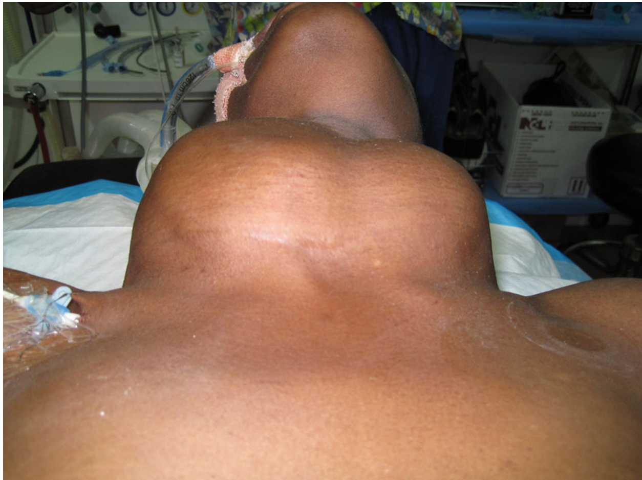
Figure 1 Large benign multi-nodular goiter. The figure illustrates the size of the large multi-nodular goiter that our patient presented with. This goiter measured 14×11 cm (right lobe) and 11×8 cm (left lobe). No retrosternal goiter was found on examination. Our patient was intubated and on the ventilator with a central line in place on the right.

compressed (Figure 3). The results of an electrocardiogram (ECG) were normal, while the results of an echocardiogram were consistent with hypertensive heart disease with an ejection fraction of 65%.