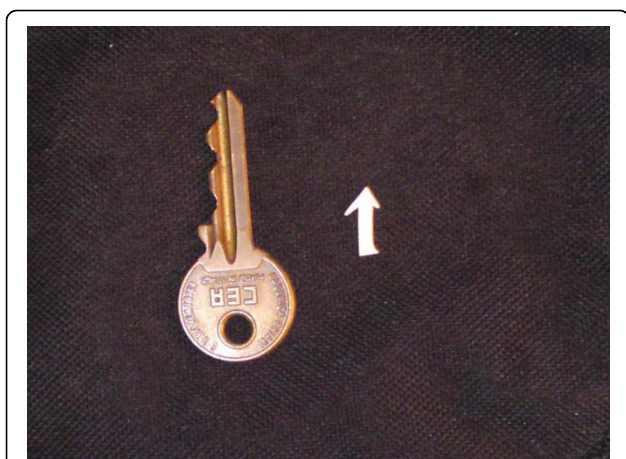
Figure 3 Dimension of the foreign body in comparison with a key.

was found and removed (Figure 1). No necrosis of bowel mucosa or hemorrhage was observed. The increased bowel spasticity that was observed was interpreted by the gastroenterologist who performed the colonoscopy as possible IBS resulting as a consequence of the foreign body irritation (Figure 2). The dimension of the foreign body is shown in comparison with a key in Figure 3. One week after the removal of the foreign body all symptoms resolved. Our patient was free of symptoms after eight months of follow up.