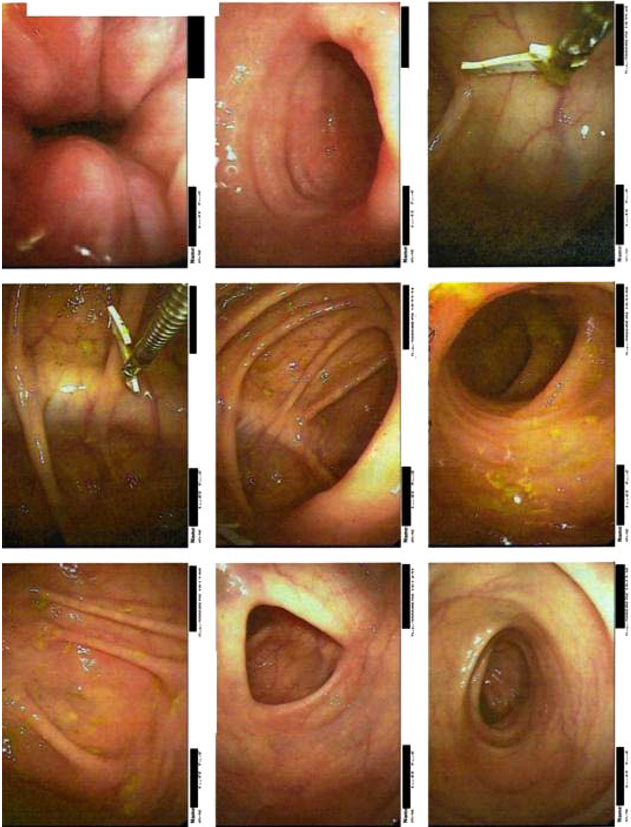
Figure 1 Colonoscopy images showing the foreign body.