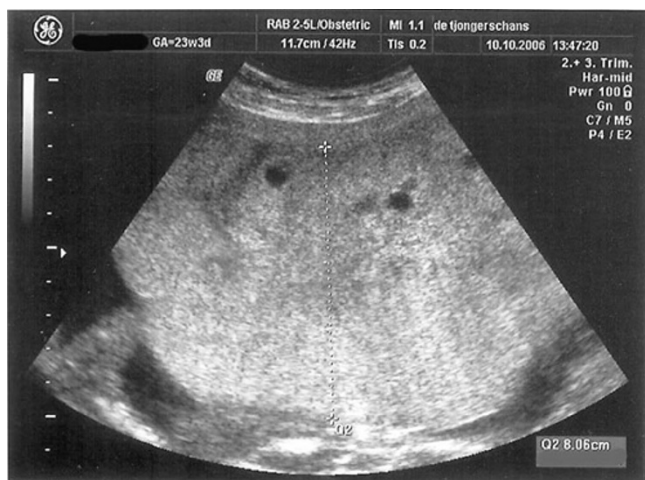
Figure 1. Placenta at 23 weeks.

3 × 250 mg was initiated to control the blood pressure with good result (Figure 2). Blood analysis showed no signs of hemolysis, elevated liver enzymes, low platelets (HELLP) syndrome. At 38 weeks, a cesarean section was performed for fetal distress. A healthy girl weighing 2,710 g was born with Apgar scores of 9 and 10 at one and five minutes, respectively. The placenta of the triploid fetus was necrotic and as a result of autolysis, no further histologic information on fetus and placenta were available. β-hCG follow-up showed no signs of persistent