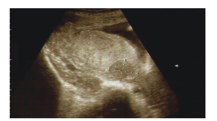
Figure 1. A hypoechoic, 3.6 \times 4.2 cm rounded mass within the placenta on ultrasound examination at 36 weeks' gestation.

At 36 weeks' gestation, a hypoechoic, 3.6 × 4.2 cm rounded mass was noted within the placenta on ultrasound examination (Figure 1). An ultrasound scan with