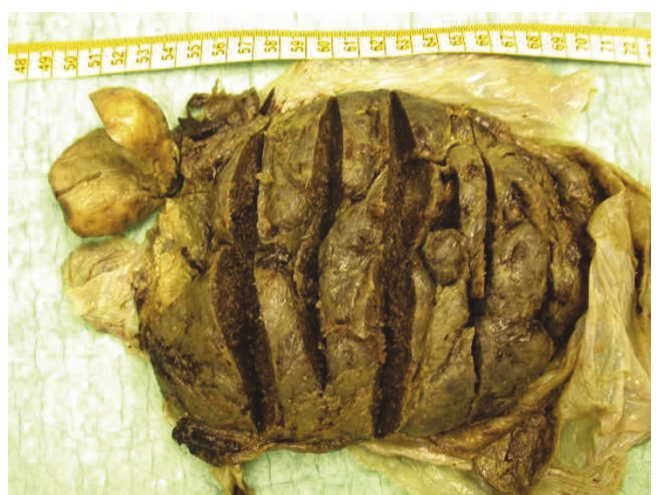
Figure 2. A round-shaped nodule on the maternal surface of the otherwise normal placenta. The tumor has been separated from its original site in the placenta.

Immunohistochemistry was positive for the smooth muscle actin antigen (Neomarkers, 1:500). Factor VIII related antigen (Dako, 1:750) and CD34 (Becton-Dickinson 1:20) marked only the endothelial cells, whereas cytokeratin of low molecular weight (Becton-Dickinson, 1:20), placental alkaline phosphatase (Dako 1:20) and desmin (Biogenex, 1:50) were negative. The method used for labeling was streptavidin-biotin. The tumor cells were positive for progesterone receptors but