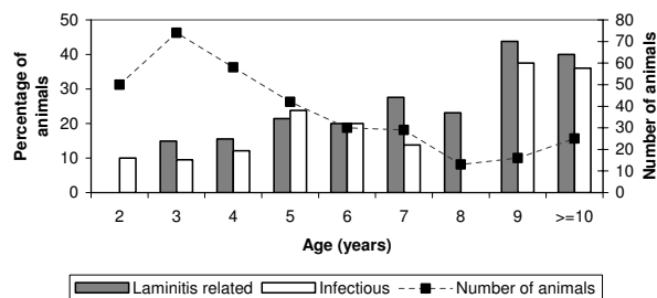
Figure 1 Total prevalence of laminitis-related and infectious claw lesions related to age in 12 Norwegian beef-cow herds.

The average calving interval was 366 days for cows with disorders, and 355 days for cows without, but the differ-