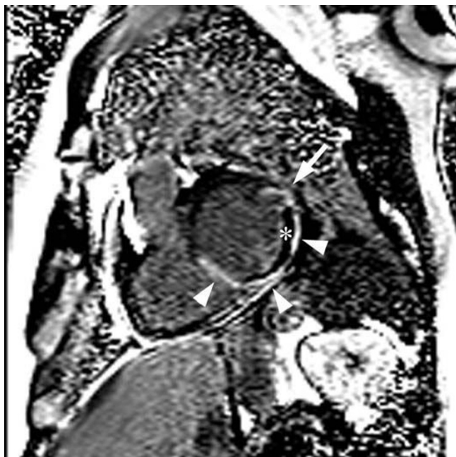
Figure 4 Short axis delayed enhancement inversion recovery MR image with phase correction after 55 minutes (SSFP-GRE) post intravenous gadolinium injection shows the large inferolateral and inferoseptal acute myocardial infarction (arrowheads) with a persistent large area of microvascular obstruction (*). The impending rupture site in the lateral left ventricular wall shows delayed enhancement of the thin overlying cover of infarcted myocardium (arrow).

the difficult diagnosis, SAEs have a high mortality rate and diagnosis is often made post-mortem.