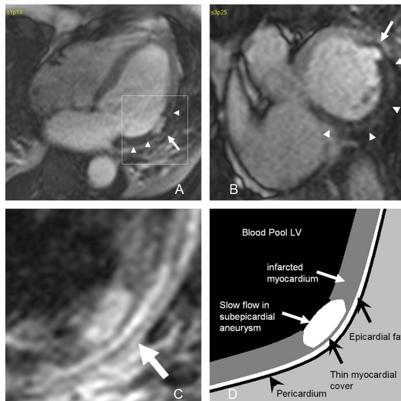
Figure 3 Axial (a) and short axis (b) first pass perfusion SSFP MR images demonstrate a large area of microvascular obstruction in the inferolateral and inferoseptal left ventricular wall (arrowheads) with an area of blister-like contrast pouch covered by a 1 mm thin rim of infarcted myocardial tissue (arrow) compatible with an impending left ventricular rupture. The magnified view (c, the area is indicated by the square in Fig. 3a) of an axial T1 weighted double inversion FSE MR image confirms the thin myocardial cover (arrow) of this subepicardial aneurysm (arrow), which has bright signal due to slower flow compared to the left ventricular blood pool. The overlying epicardial fat (arrowhead) and pericardium are normal. Figure 3d represents a drawing of the complex anatomy in figure 3c.