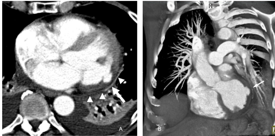
Figure 2 Axial contrast enhanced CT image of the chest (a) shows an area of decreased perfusion in the lateral wall of the left ventricle (arrowheads) with a 1 × 1.6 cm blister-like pouch (arrow). A volume rendered 3D MDCT image (b) of the left ventricle shows an area of localized contrast out-pouching with a narrow neck in the lateral left ventricular wall (arrow).