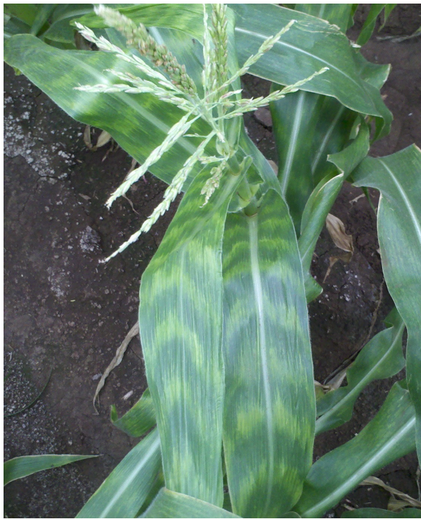
Figure 3. Zebra striping in a fully mature corn plant grown on Moloka'i, Hawaii in winter 2011. All of the adult leaves were marked by crosswise normal dark green and chlorotic (yellow green) bands. It takes about 10 days for an adult leaf to develop, and pairs of green and yellow-green bands are inferred to represent a 24-hour period of leaf development. Without further tests it is not possible to pinpoint whether normal chloroplast development or stability is heat or cold sensitive. Ambient day temperatures were 23 to 27°C, just slightly elevated over night temperatures of 17 to 21°C. Zebra striping is highly persistent in maize because zones of poor differentiation are not repaired during growth at the permissive temperature.

the 10-day period of blade development. In many grasses, defective stripes are not restored to wild-type phenotype but remain a report on temperature fluctuations beyond the optimal range over the course of leaf growth.