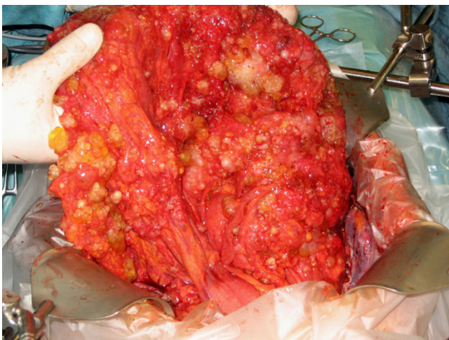
Figure 1 'Omental cake' in a patient with peritoneal carcinomatosis arising from appendiceal cancer.

CRS consists of numerous surgical procedures depending on the extent of peritoneal tumor manifestation. In appendiceal malignancies, the omental cake, a disseminated tumor infiltration of the greater omentum, represents the most affected abdominal area (Fig. 1). Surgery may include parietal and visceral peritonectomy, greater omentectomy, splenectomy, cholecystectomy, resection of liver capsule, small bowel resection, colonic and rectal resection, (subtotal) gastrectomy, lesser omentectomy, pancreatic resection, hysterectomy, ovariectomy and urine bladder resection. In patients with mucinous tumors and infiltration of the umbilicus, an omphalectomy is necessary. Extraperitoneal dissection may enable the anterior parietal peritonectomy and avoid a tumor contamination of the abdominal wall (Fig. 2). The extent of intraperitoneal tumor manifestation is determined using the peritoneal cancer index (PCI), a combined numerical score of lesion size (LS-0 to LS-3) and tumor localization (region 0–12) [13,14]. The aim of CRS is to