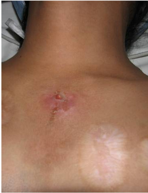
Figure 1 A left parasternal cutaneous fistula.