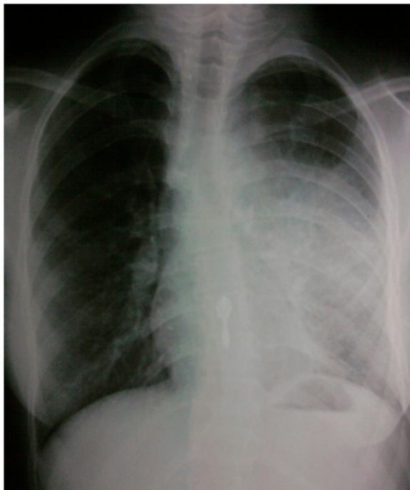
Figure 2 Chest radiography: left anterior mediastinal tumor.