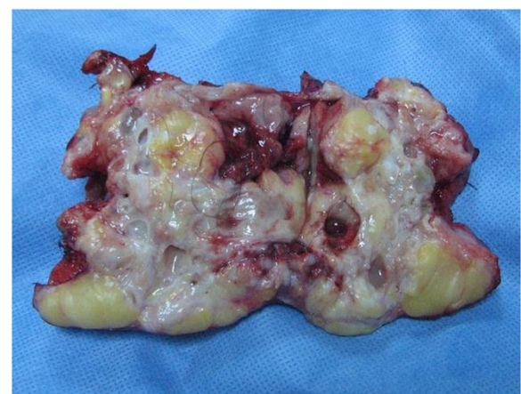
Figure 4 Surgical resection specimen.

The etiology of perforation of mediastinal teratomas is still controversial, although ischemia, infection and inflammation have been proposed [1]. Tumor size or wall thickness are not significant predisposing factors for tumor rupture [1]. On the other hand, cystic teratoma