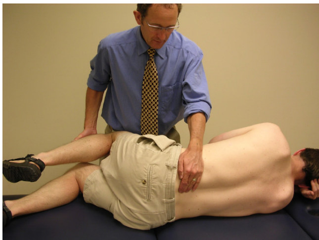
Figure 2 The passive physiological intervertebral motion (PPIVM) test in flexion. The patient is positioned side-lying. The clinician palpates the interspace between the adjacent spinous processes of the target motion segment with one finger, while moving the lumbar spine from neutral into flexion via the patient's uppermost limb.