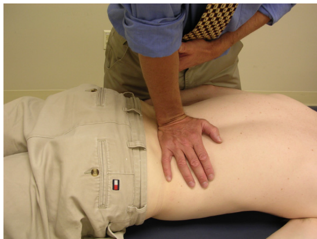
Figure 1 The central posteroanterior passive accessory intervertebral motion (PAIVM) test. The patient lies prone. The clinician contacts the spinous process of the target vertebra with the hypothenar eminence, and delivers a gradual posteroanteriorly directed force.

Physiotherapists with post-graduate training in musculoskeletal manual therapy recruited consecutive eligible patients presenting with a new episode of recurrent or chronic low back pain (R/CLBP). Recruiting took place in the physiotherapists' own clinics, between October 2001 and August, 2003. Patients were included if i) they presented with a new episode of low back pain and, ii) they had experienced similar low back pain before, the first episode of which was at least three months prior to the