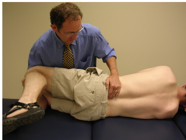
Figure 3 The passive physiological intervertebral motion (PPIVM) test in extension. The patient is positioned side-lying. The clinician palpates the interspace between the adjacent spinous processes of the target motion segment with one finger, while moving the lumbar spine from neutral to extension via the patient's uppermost limb.

assessment of spinal motion. Consenting patients were referred to radiology for flexion-extension lateral radiographs.