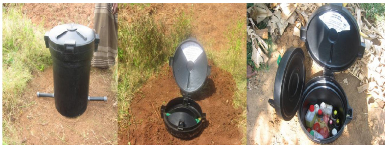
Figure 3 Safe storage device for agrochemicals in Sri Lanka. The UV-resistant plastic pesticide storage container to be used in this study. A) Device before installation: the metal bar at the base secures the device from theft. B) Device buried with two lids to protect the padlock from weather damage. C) Device can store several large and small bottles of pesticides.

pesticide self-poisoning, both fatal and non-fatal, amongst villagers aged 14 years or older, over the three-year study period. Secondary outcomes will include the incidence of: pesticide poisoning in general (deliberate and accidental, all ages), self-harm (all methods, both fatal and non-fatal), self-poisoning (all substances) and pesticide poisoning in children (younger than 14 years).