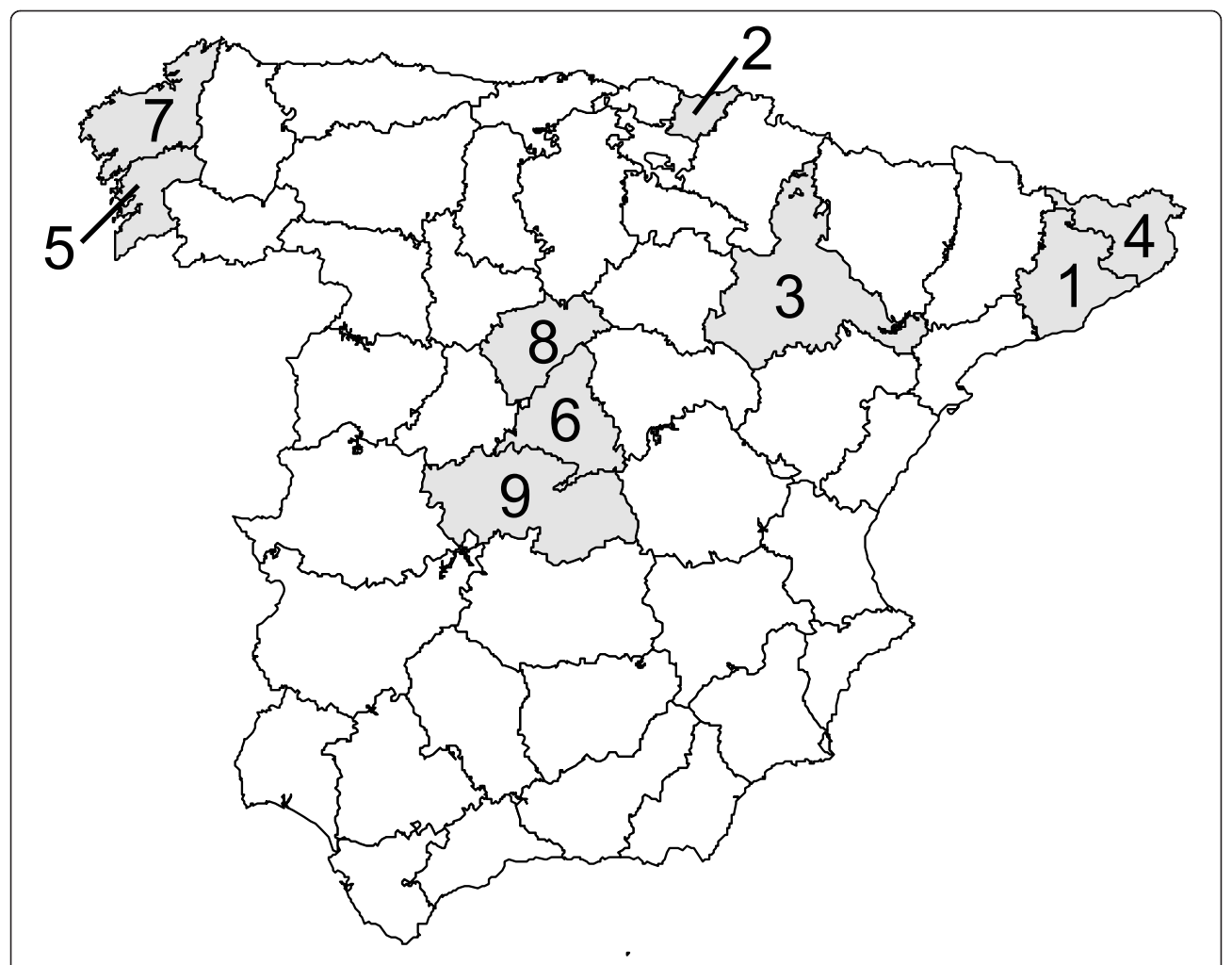
Figure 1 Locations participating in the study . 1. El Prat de Llobregat (Barcelona), n = 59; 2. Irún-Hondarribia (Guipúzcoa), n = 57; 3. Zaragoza, n = 31; 4. Gerona, n = 75; 5. Isla de Arosa (Pontevedra), n = 53; 6. Getafe (Madrid), n = 98; 7. Santiago de Compostela (La Coruña - Corunna), n = 33; 8. Cantalejo (Segovia), n = 24; 9. Toledo, n = 73.

also those in residential care and were drawn from rural and urban areas. Losses resulted from dead and inability to locate individuals surveyed in earlier studies, circumstances unlikely to induce specific selection biases in a geographically-defined prevalent sample. Death excludes individuals from the pool of survivors. Non-located individuals (due to death or change of residence outside the geographic residence) shall also be considered outside the sampling frame.