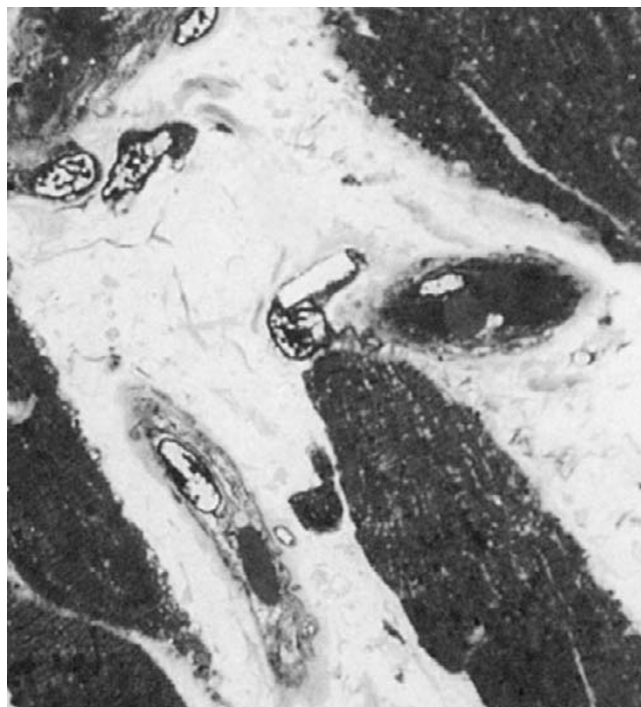
Figure 2 Myocardium with the interstitial histiocytes with rectangular cystine crystal.

Cystinosis is an autosomal recessive disorder characterized by excessive storage of cystine in several organs, including kidney, spleen, liver, lymph node, cornea and thyroid gland [1,2]. Individuals typically present in the first year of the life with symptoms of severe fluid and electrolyte disturbance, a renal Fanconi syndrome, growth failure, and photophobia. Without specific treatment, they progress to end-stage renal failure (ESRD) by end of the first decade. A rare 'late-onset' form of cystinosis presents in older children with renal impairment but not necessarily a Fanconi syndrome. Adults with 'benign' cystinosis have asymptomatic corneal cystine deposition but do not have progressive renal damage [1,2,7,8]. The diagnosis of nephropathic cystinosis can be confirmed by slit lamp examination of the cornea which reveals needle shaped, tinsel-like refractive opacities. The levels of cystine can be measured in bone-marrow cells, leukocytes, and cells of the rectal mucosa [1,2,7,8]. Renal involvement is characterized by cystine depositions in the interstitium as well as glomerular and tubular epithelium.