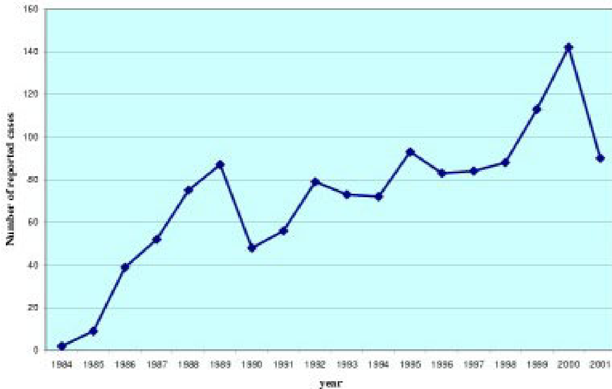
Figure 2 Annually reported HIV infections among Saudi citizens from 1984 through 2001.

products in 1986. The vast majority of Saudi HIV-infected women with identifiable risk factors acquired the infection through blood transfusion or marital sex with their infected husbands. The large proportion of patients with "unknown" risk factors was likely due to deliberate concealment of the actual risk factors, likely to be illegal sex, by the infected patients as non-marital sex and homosexuality are prohibited in Islam, the religion of all Saudi citizens and the vast majority of expatriates living in Saudi Arabia.