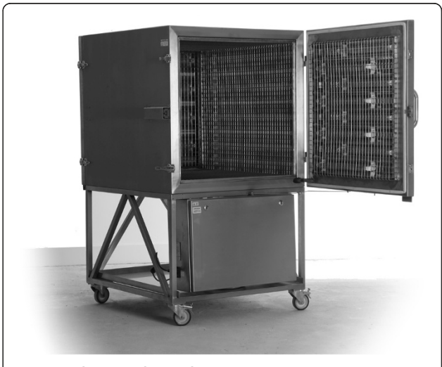
Figure 1 The Nanoclave Cabinet.

Clinical isolates were taken from clinical specimens and stored in the microbiology laboratory. Only the isolated microorganisms and not the specimens (e.g. urine; sputum; faecal samples) were stored. Clinical isolates were fully anonymised and testing was only to assess the effectiveness of the Nanoclave Cabinet. The organisms