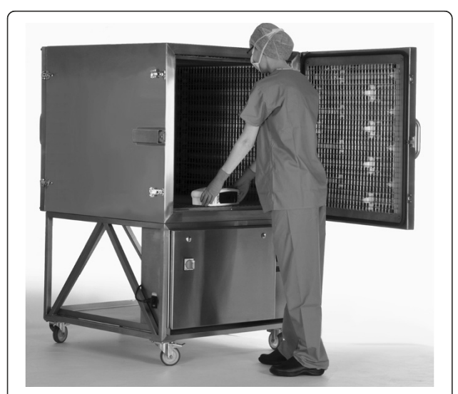
Figure 4 Placing an item to be disinfected inside the Nanoclave Cabinet.

Adenovirus is associated with respiratory, ocular and gastrointestinal disease, especially in children. Once excreted, it can survive and remain infectious within the environment for up to 35 days. As a double stranded DNA virus, Adenovirus is particularly resistant to UV