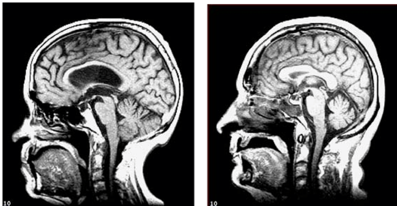
Figure 2 Midline sagittal MRI scans to illustrate subjects with relatively more (a) and less (b) atrophy. Atrophy is estimated by correcting whole brain volume (WBV) for intracranial area (ICA).

residuals from linear regression. Data reduction was performed using principal components analysis.