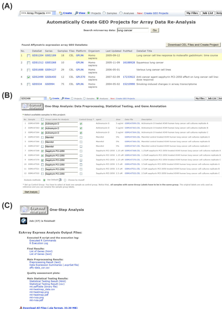
Figure 3 Express Analysis is a fully automated microarray data analysis program. (A) Users can search for GEO DataSets, download CEL supplementary files, and create EzArray projects to analyze previously published data. The sample information is automatically populated in the project based on the subset information stored in GEO GDS records. (B) Selecting samples to start new Express Analysis. While in most cases, default analysis methods and parameters can be used directly due to our built-in logics, experienced users have options to select methods and enter specific analysis parameters. Once the analysis is started, a pop-up window will appear showing currently running jobs. On the pop-up window, users can stop running jobs, remove failed jobs, or review finished jobs. In addition, users do not have to wait for results; instead, they can bookmark the page and come back later to review the results. (C) Example execution results from a run of Express Analysis with data shown in (B). The resulting files, including executed scripts and execution logs, are classified, listed, hyper-linked, and compressed in one file for easy downloading.